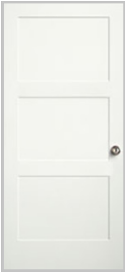
Standard Hinge Locations