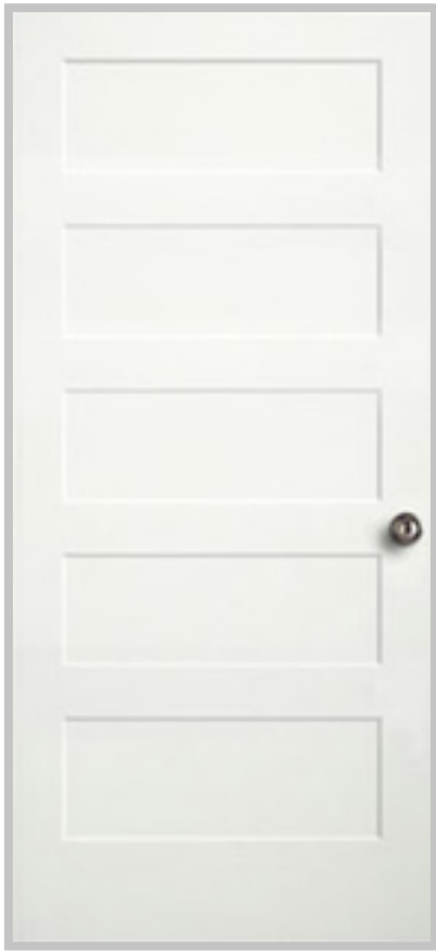
Standard Hinge Locations