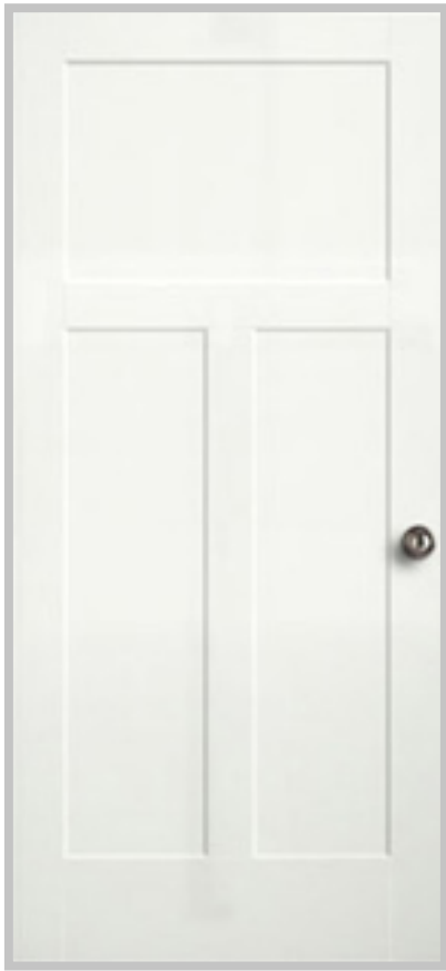
Standard Hinge Locations