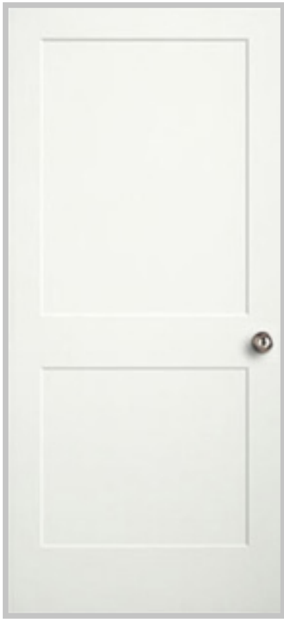
Standard Hinge Locations